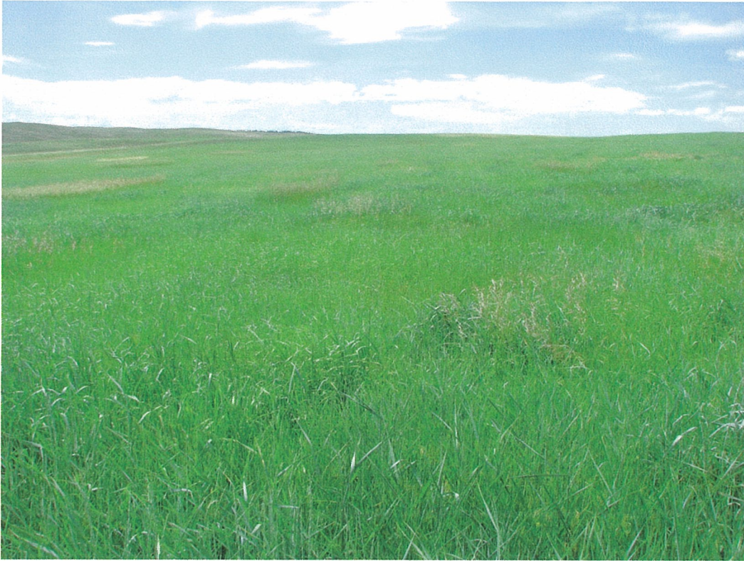
Photo 3. Hayland Type on the Roger's Pit area in July of 2008.