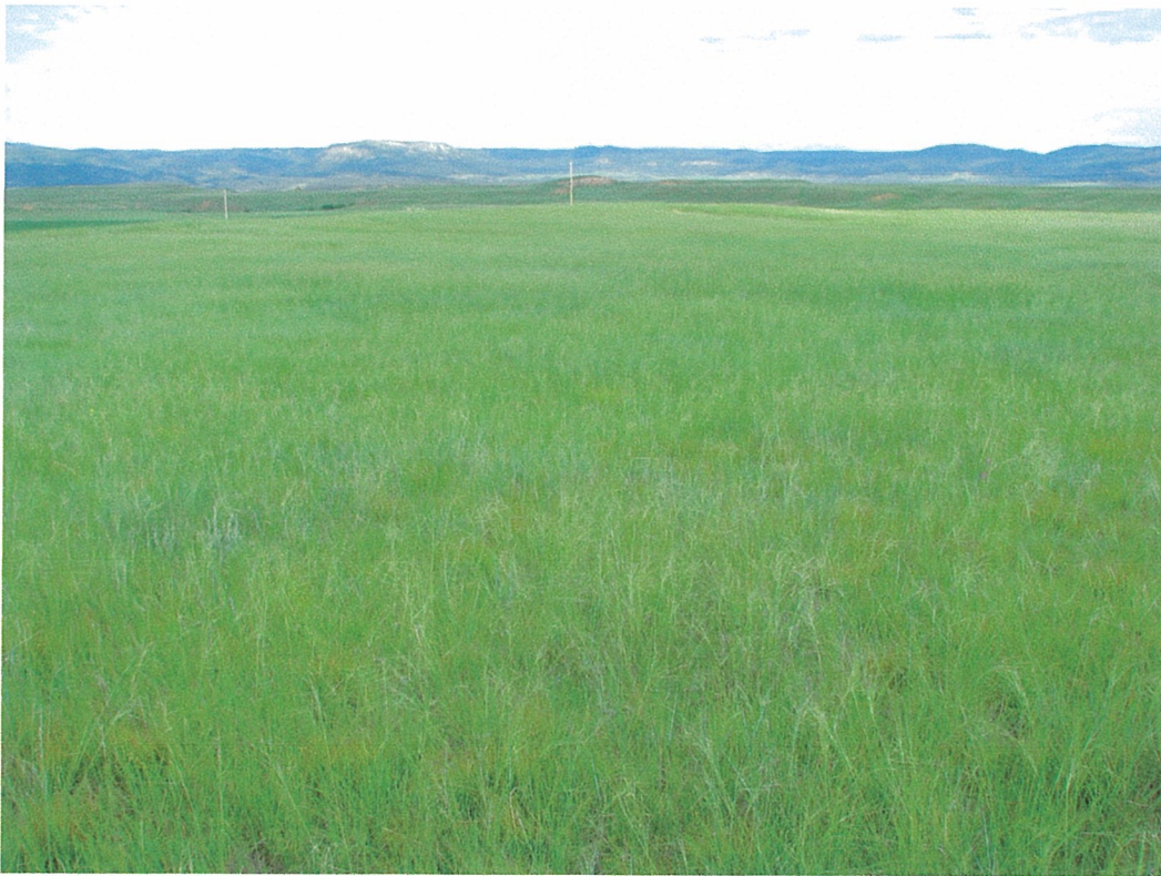
Photo 2. Upland Grassland Type on the Roger's Pit area in July of 2008.