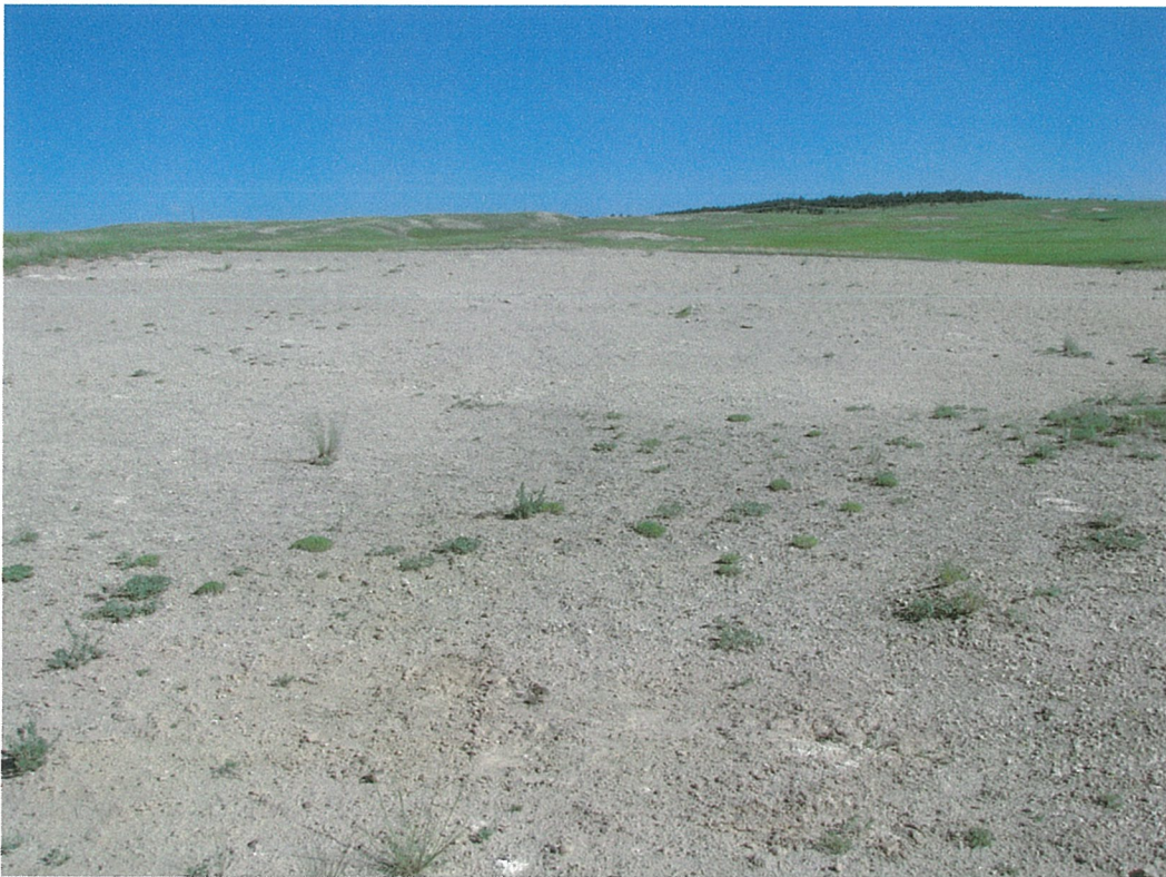
Photo 4. Barren Type on the Roger's Pit area in July of 2008.