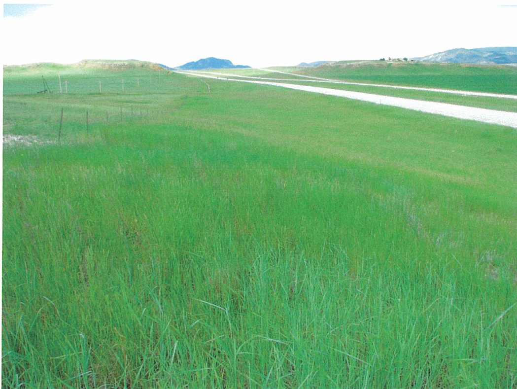
Photo 5. Disturbed Land Type on the Roger's Pit area in July of 2008