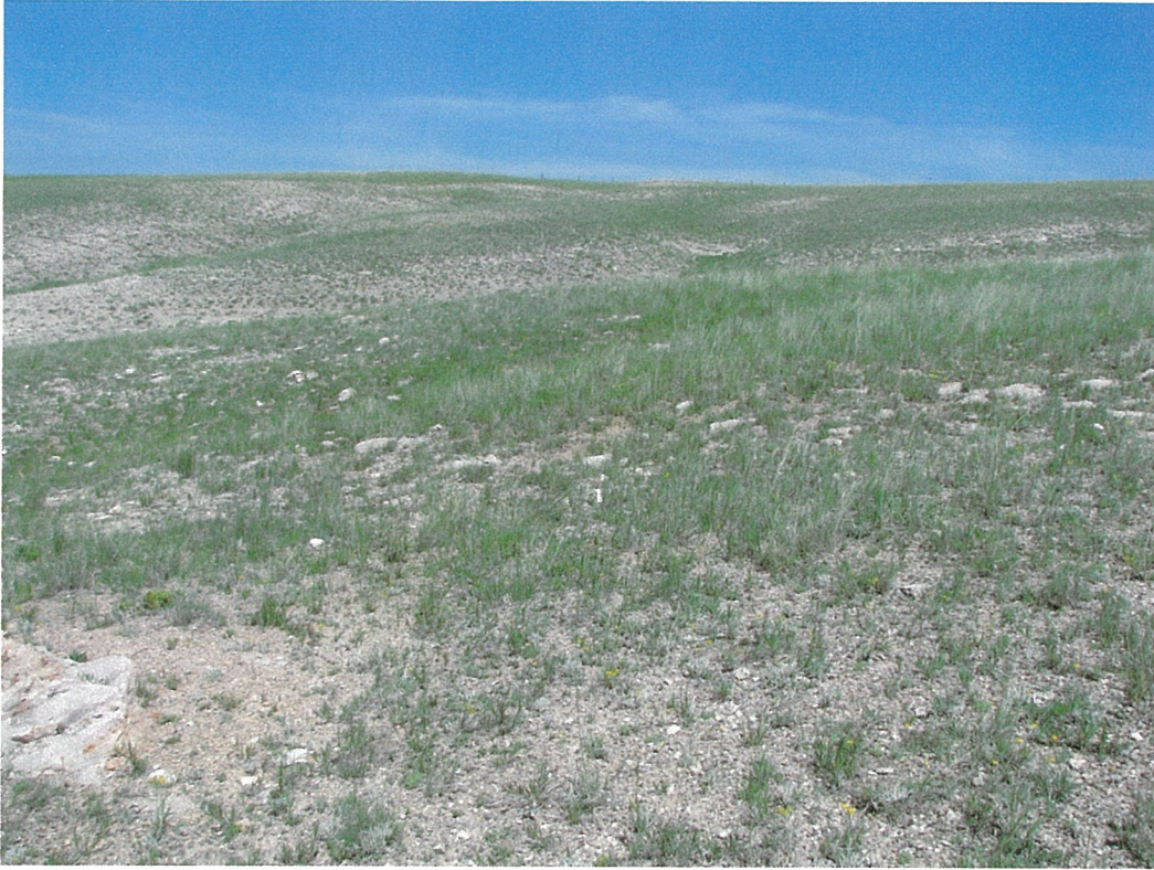
Photo 1. Rocky Grassland Type on the Roger's Pit area in July of 2008.