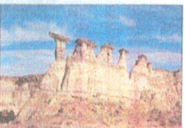
These striking spires are found on the Adobe Town Rim

One of the lower rims in Adobe Town, this is the area with the greatest complexity of geological features. Arches, window rocks, and mazes of pinnacles characterize this area, which shows off the variety and rare beauty that makes Adobe Town famous.