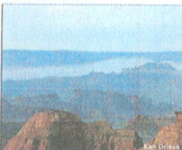
Mist settles over Skull Creek Rim

The thousand-foot palisades of the Skull Creek Rim present the geologic wonders of Adobe Town at a magnificent scale. Here, the lofty promontories descend through badlands banded in pinks and reds to the vast and empty desert floor below. Atop the rims, there is easy traveling through easily eroded boulders and among sand dunes stabilized by sagebrush and prickly pears. In the early summer by the tiny blossoms of wildflowers.