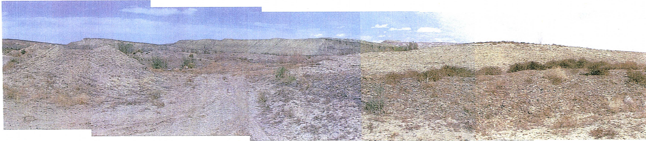
Photo 2: Panoramic of site looking north to west from the west side of the main pit area. The stockpile to the left of the photo has been partially graded down.

Permit Number: 813ET Status: Abandoned Pit Former Operator: Nicholls & Lewis Date of Photo: April 16, 2004