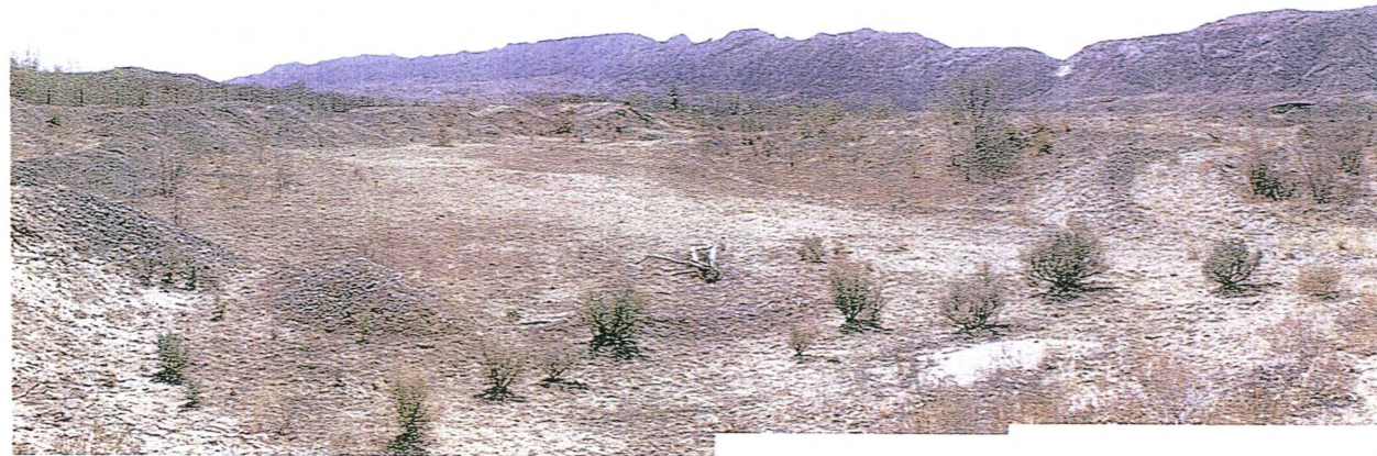
Photo 3: Panoramic of site looking south, from the north side of the main pit area. The stockpiles, left of photo, run along the entire east edge of the site along the river. The stockpile to the right of the photo has been partially graded down. Pit area in the center is barren. Vegetation has not filled in.