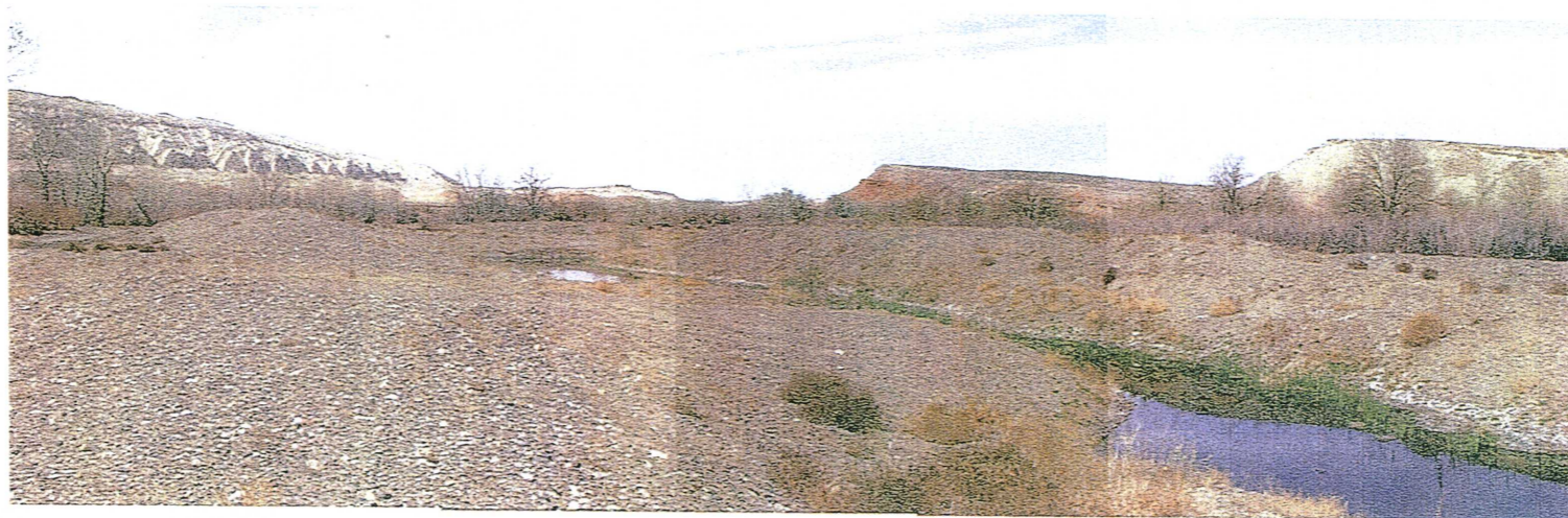
Photo 5: Panoramic of smaller pit area to the north looking north.

Permit Number: 813ET Status: Abandoned Pit Former Operator: Nicholls & Lewis Date of Photo: April 16, 2004