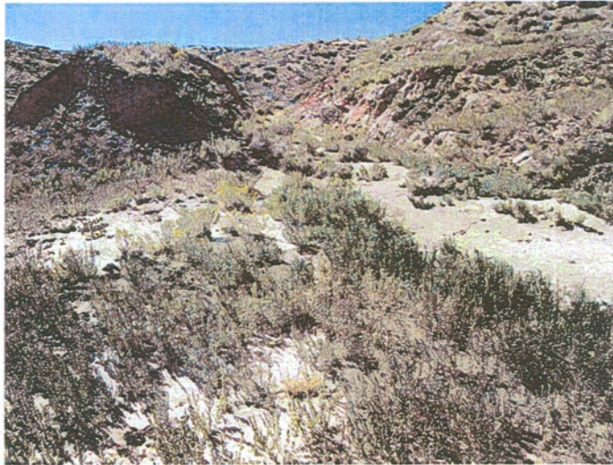
Photo 5. View looking west along the excavated trench where highwalls were present. eFrame IMG_0562.