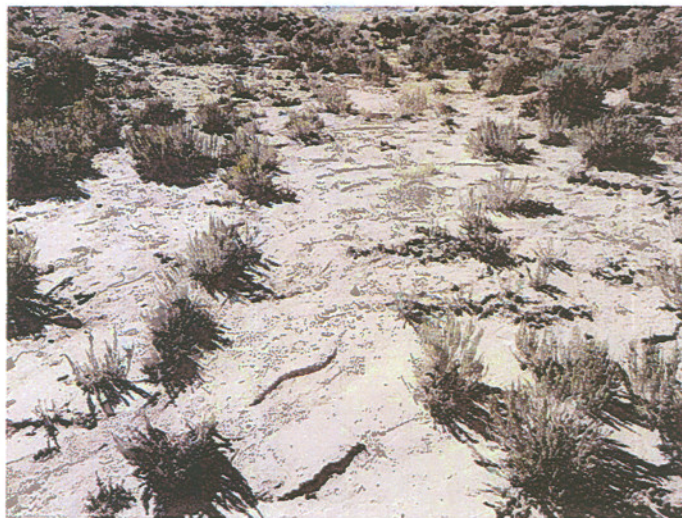
Photo 2. View of minor native drainage up stream of the access road and culvert where background sheet erosion was extensive. eFrame IMG_0565.