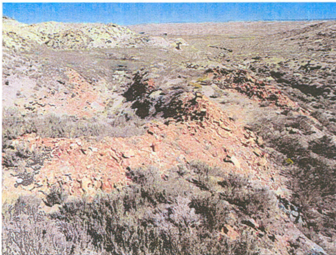
Photo 6. View looking east along the scoria trench where highwalls were present. eFrame IMG_0564.