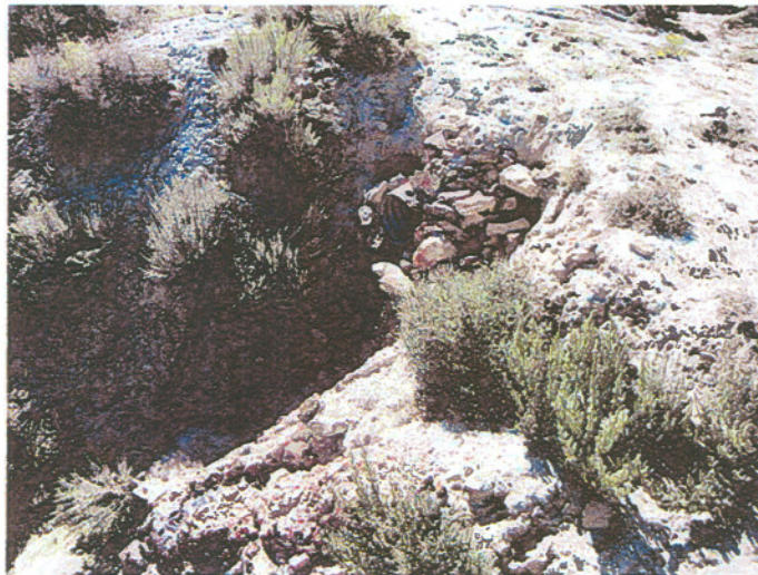
Photo 4. View of downstream end of the culvert under the access road where erosion was ongoing. eFrame IMG_0560.