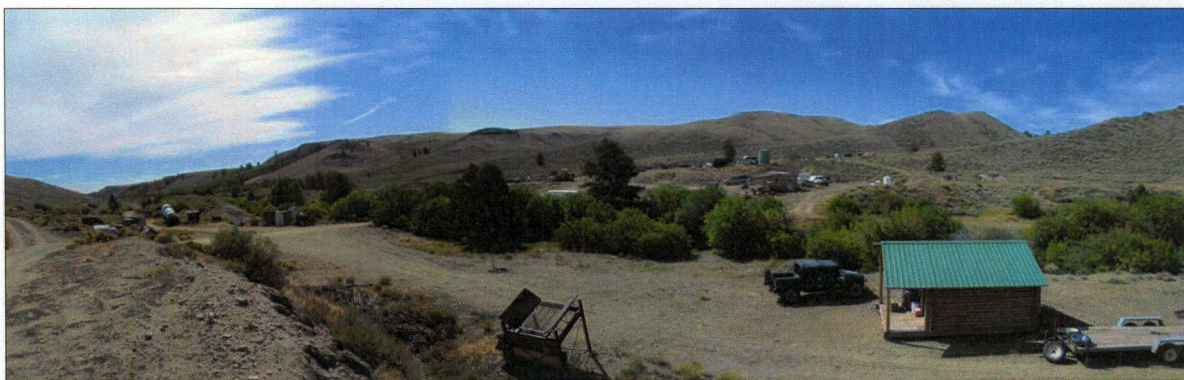
Photo Number 19: This is a view looking east from the road leading to the site. It depicts the solid waste stored north of Rock Creek.