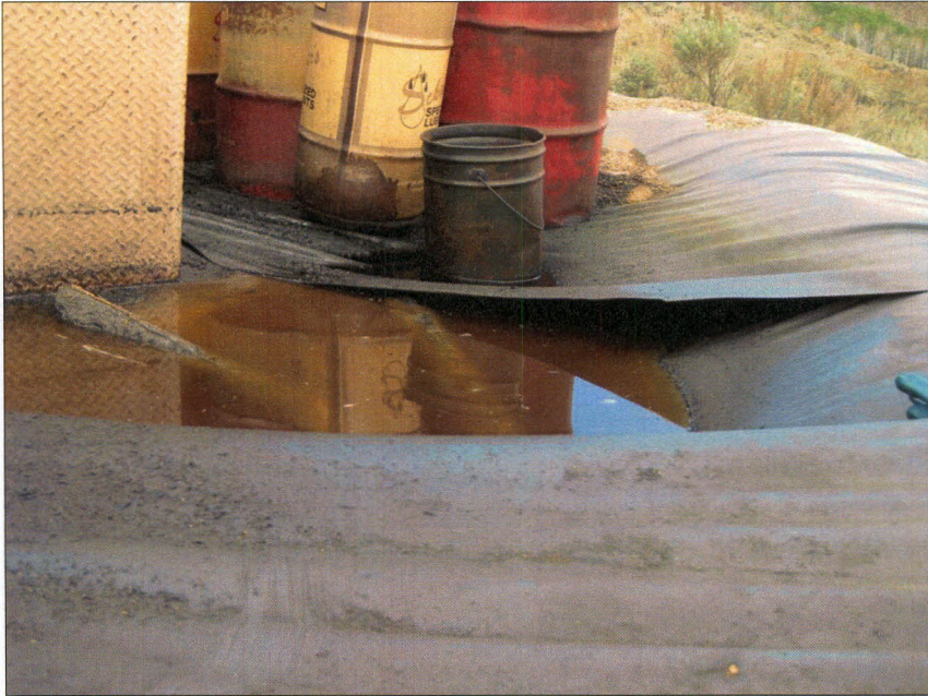
Photo Number 14: This is a close up of the liner depicted in Photo Number 13.