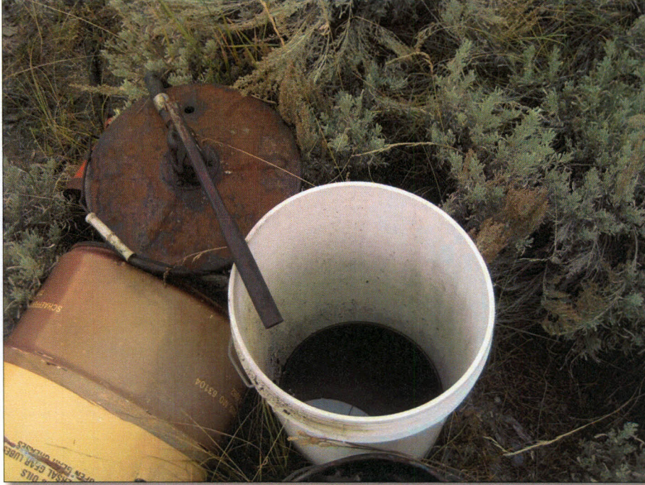
Photo Number 12: This depicts a five-gallon bucket with some kind of hydrocarbon in it. There is no lid on this bucket.