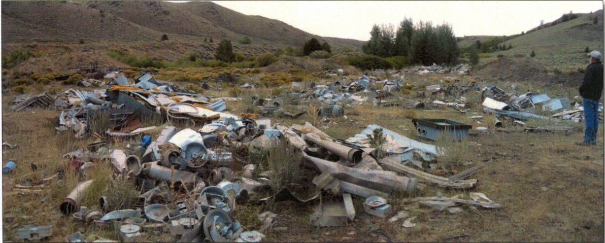
Photo Number 1: This depicts an area east of the processing area where scrap aluminum is stored. This view is looking toward the southeast.