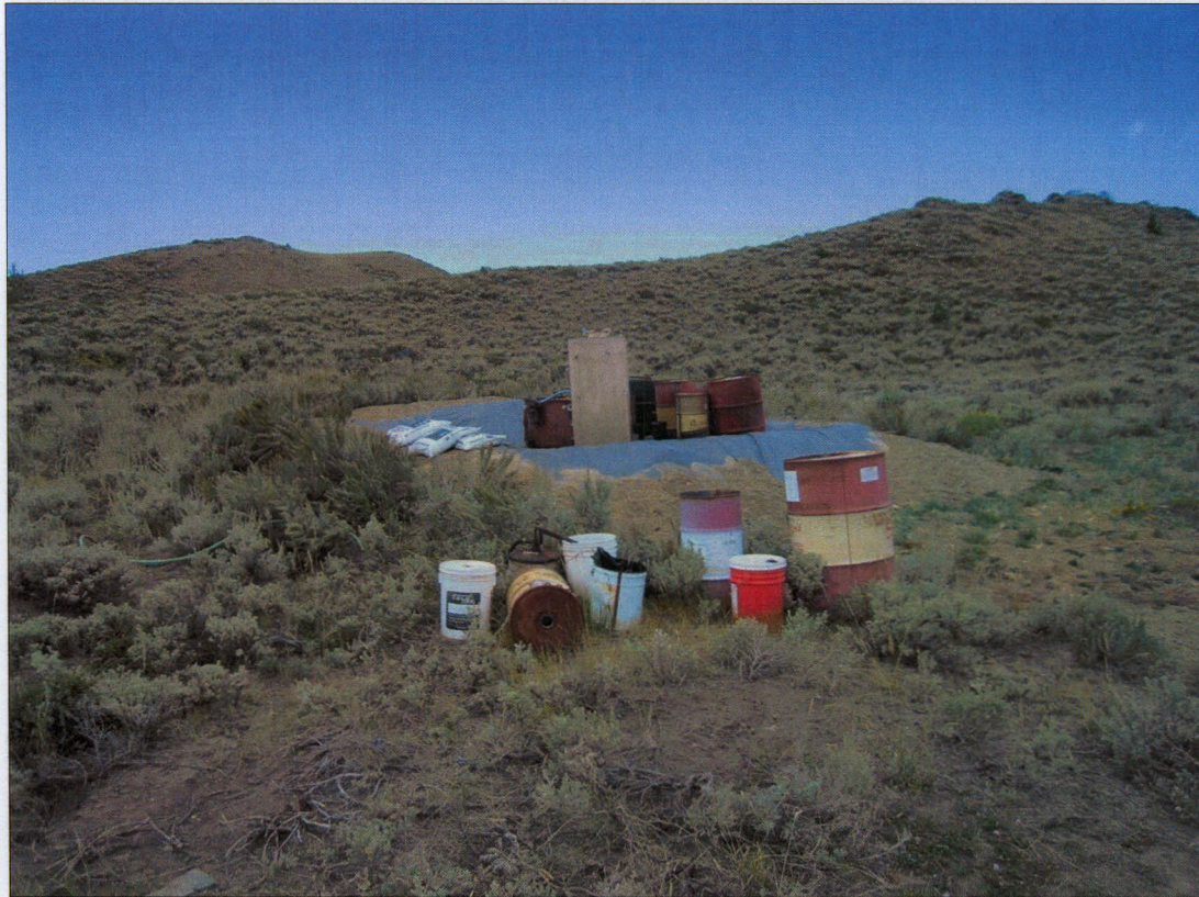
Photo Number 6: This depicts one of the hydrocarbon storage areas at the site. The upper portion at this location is the lined/bermed area mentioned in the text.