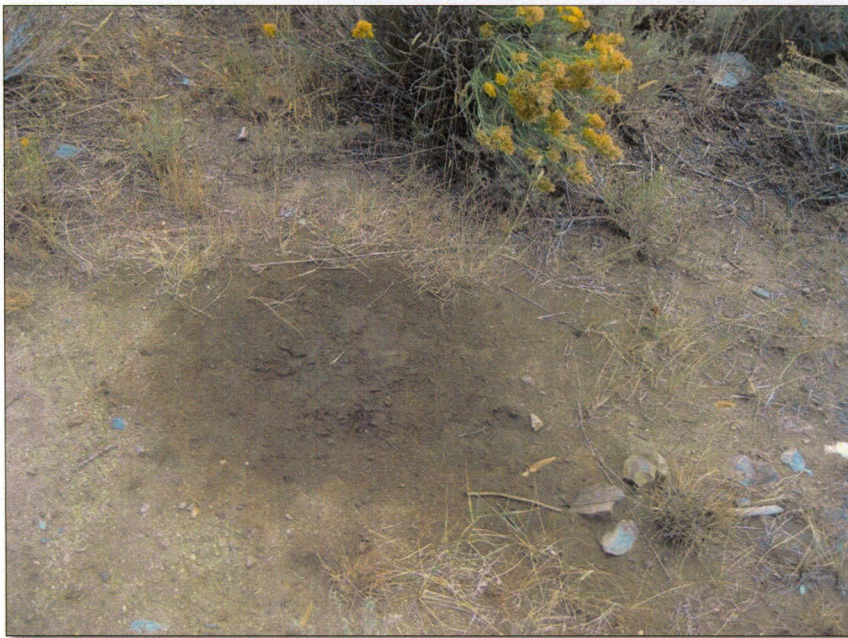
Photo Number 17: This depicts a close-up of the PCS in front of the blue and white truck depicted in Photo Number 16.