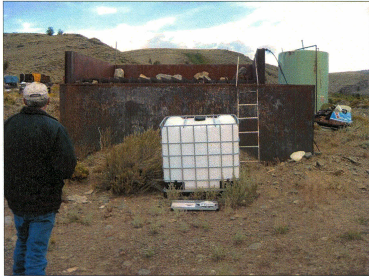
Photo Number 10: This depicts a plastic container with approximately six inches of fluid in it. Its placard has the number 1805 on it which is the corrosive, Phosphoric Acid.