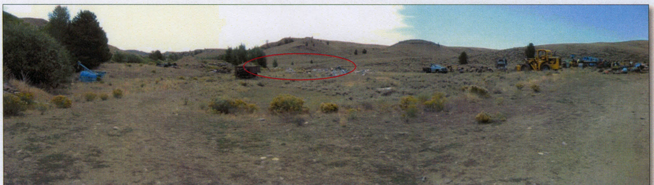
Photo Number 7: This is a view of the eastern portion of the site. It is a panoramic looking from east-northeast to the south. The aluminum scrap pile depicted in Photo Number 1 is noted by the red oval. The vantage point of this panoramic view is from the center of the site. The processing area/ponds are to the right of this viewpoint.