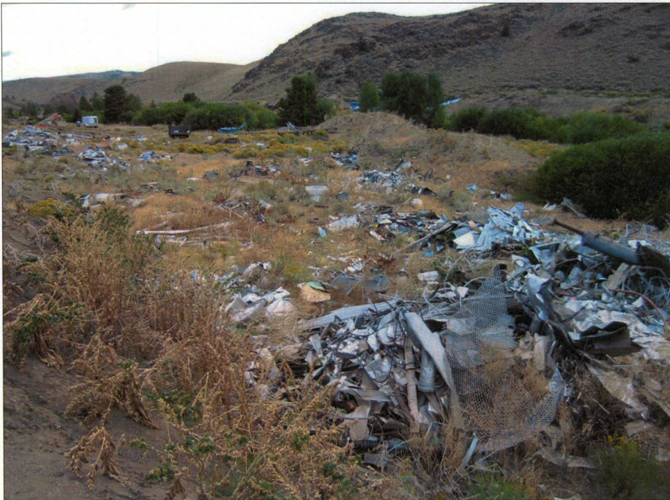
Photo Number 2: This is another view of the aluminum scrap area. This view is looking to the northwest.