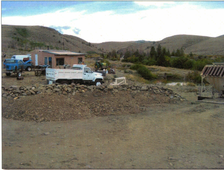
Photo Number 8: This depicts the stockpile and processing area. The “first pond” (easternmost settling pond) can be seen in the top right of this photo. The view is looking to the southwest, from the same vantage point as Photo Number 7.