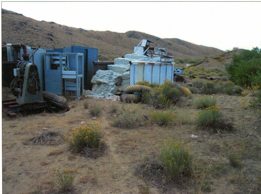
Photo Number 11: This depicts some other scrap materials stored on the site.