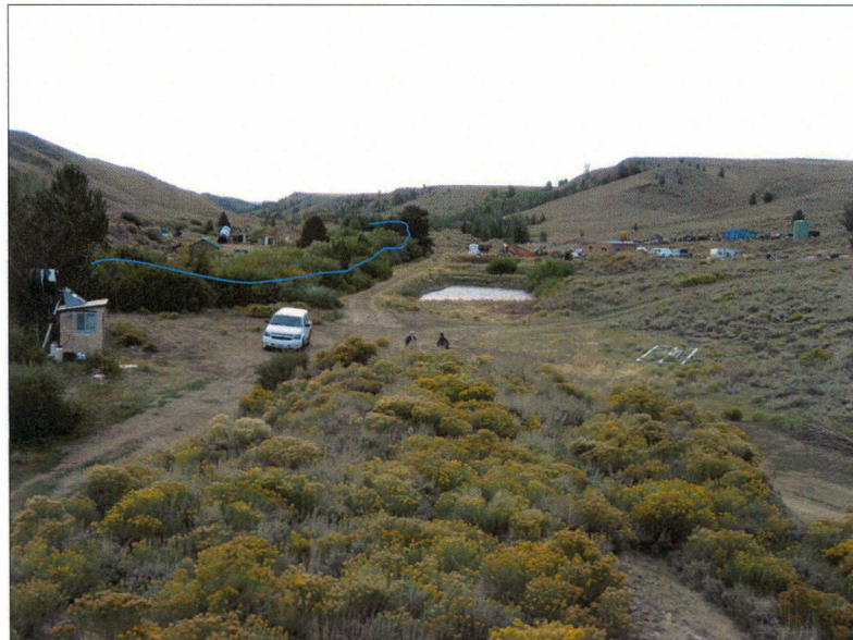
Photo Number 9: This is a view of the entire site looking east from its west end. The vantage point is from the old dredge pile west of the site. The outhouse depicted in Photo Number 4b can be seen on the far left side of this picture. The blue line denotes the path of Rock Creek (beneath the vegetation). Thus, it can be seen that there is solid waste stored south and north of Rock Creek. And the outhouse is adjacent to Rock Creek.