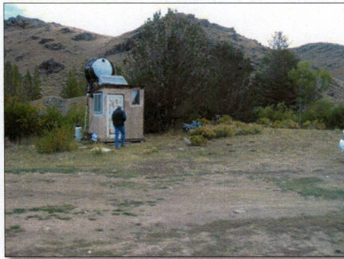
Photos Numbered 4a and 4b: The photo on the left depicts a cabin that has been placed to the west of the processing area. The photo on the right depicts an outhouse that is located north of the cabin, also west of the processing area. It is believed that this cabin is occupied by Roger, the site watchman. LQD understand that the placement of these structures has not been authorized by Mr. Bixler, partial owner of this property.