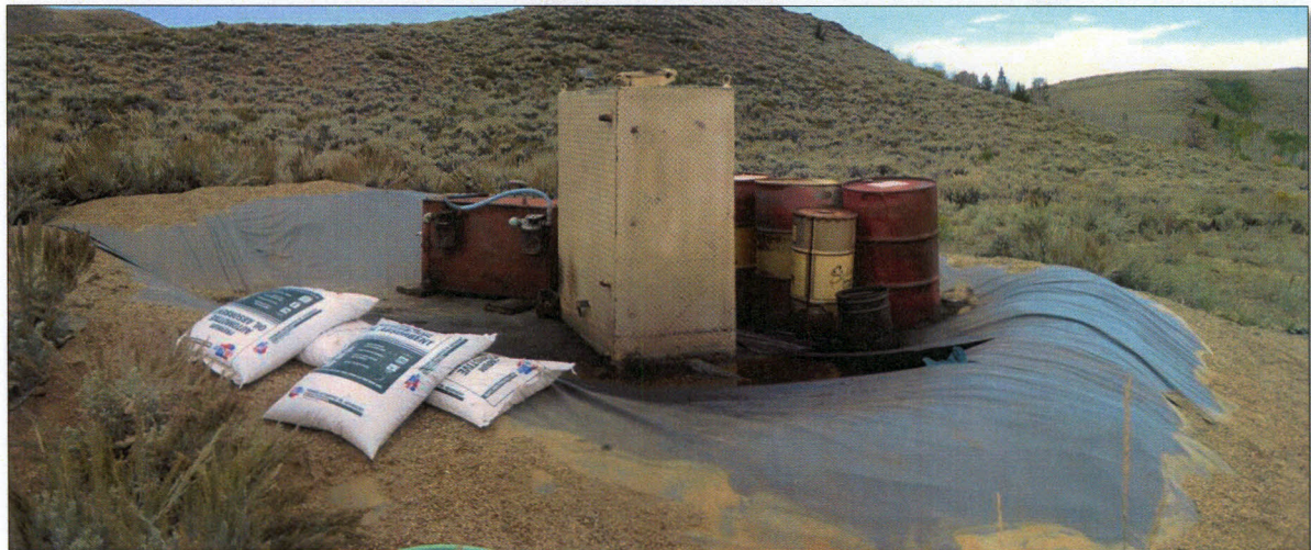
Photo Number 13: This depicts the hydrocarbon storage area that was bermed and lined in August 2010 and documented via pictures sent to LQD by Carl Anderson. There is a break in the liner, a close up of which is depicted in Photo Number 14.