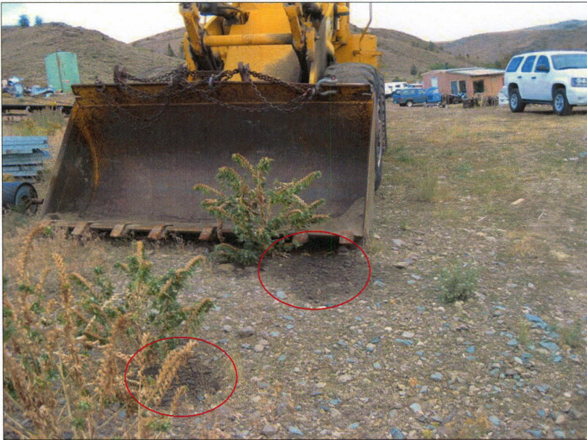
Photo Number 15: This depicts two of several petroleum-contaminated soil stains (red ovals) noted at the site. There is also the noxious weed, Henbane in this picture.