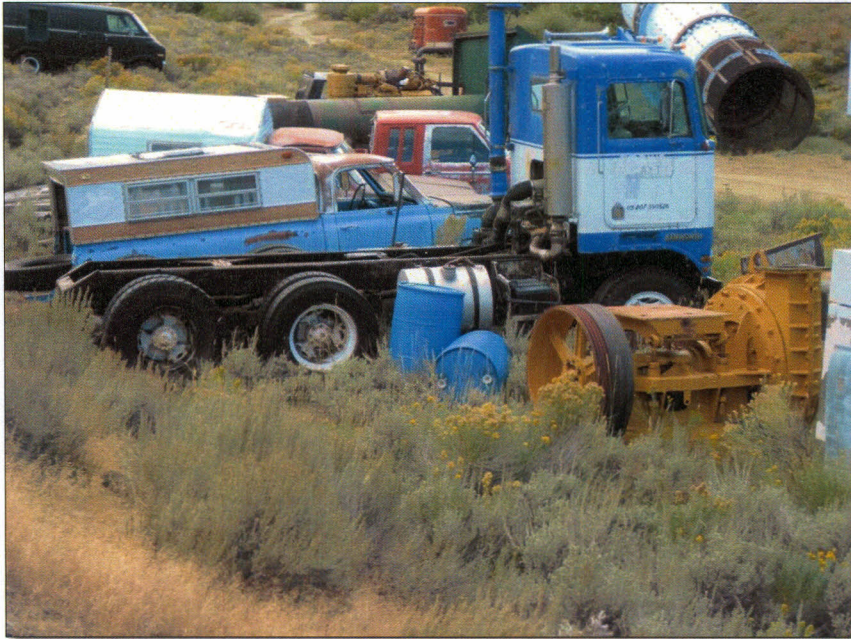
Photo Number 16: This depicts some of the abandoned vehicles parked north of Rock Creek at the 238LE site. In front of the blue and white truck in the foreground of this picture is a spot of PCS, a close-up of which is provided in Photo Number 17.