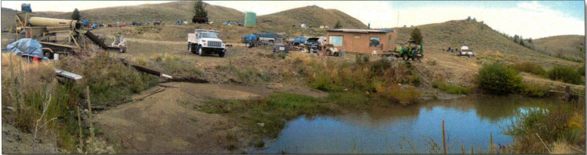
Photo Number 3: This depicts the easternmost processing/settling pond.