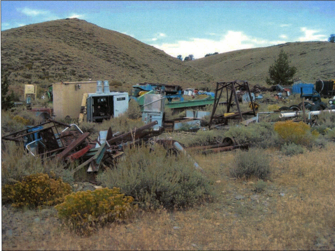
Photo Number 18: This depicts more of the solid waste stored north of Rock Creek at the 238LE site.