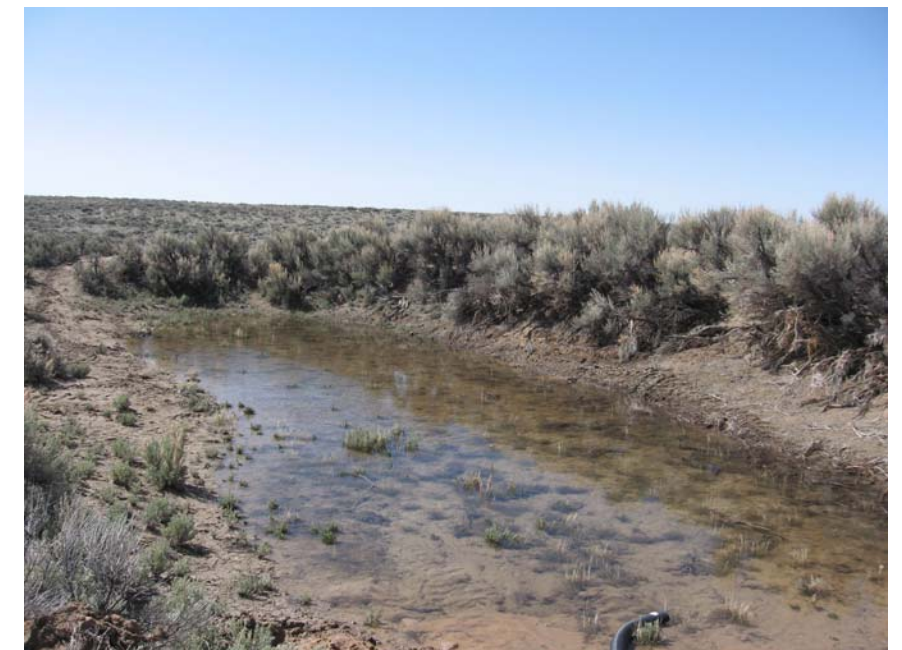
Dirt 'tank' at pipeline outlet from Battle Spring Draw Well No. 4551. April 2009.