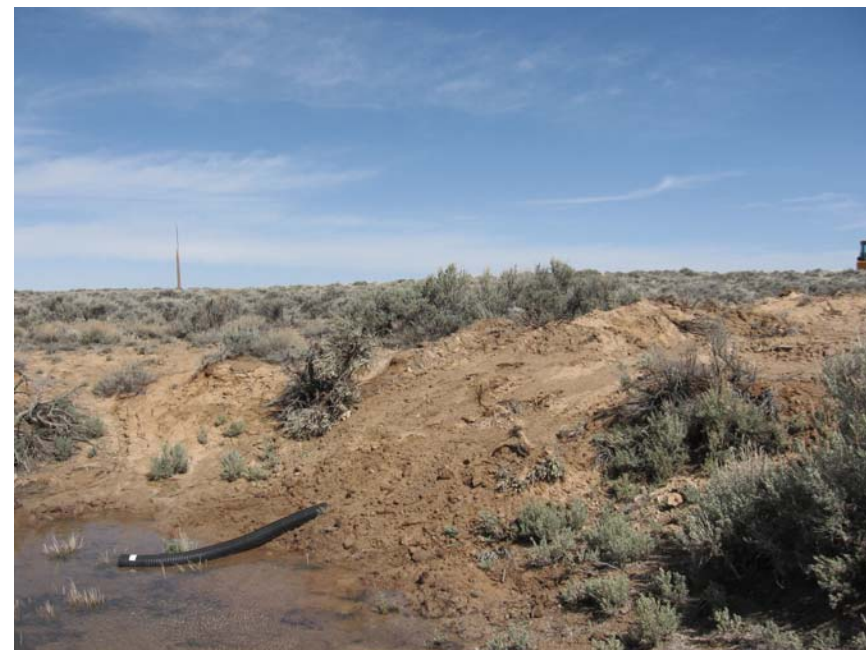
Pipeline outlet from Battle Spring Draw Well No. 4551 to dirt 'tank'. April 2009.