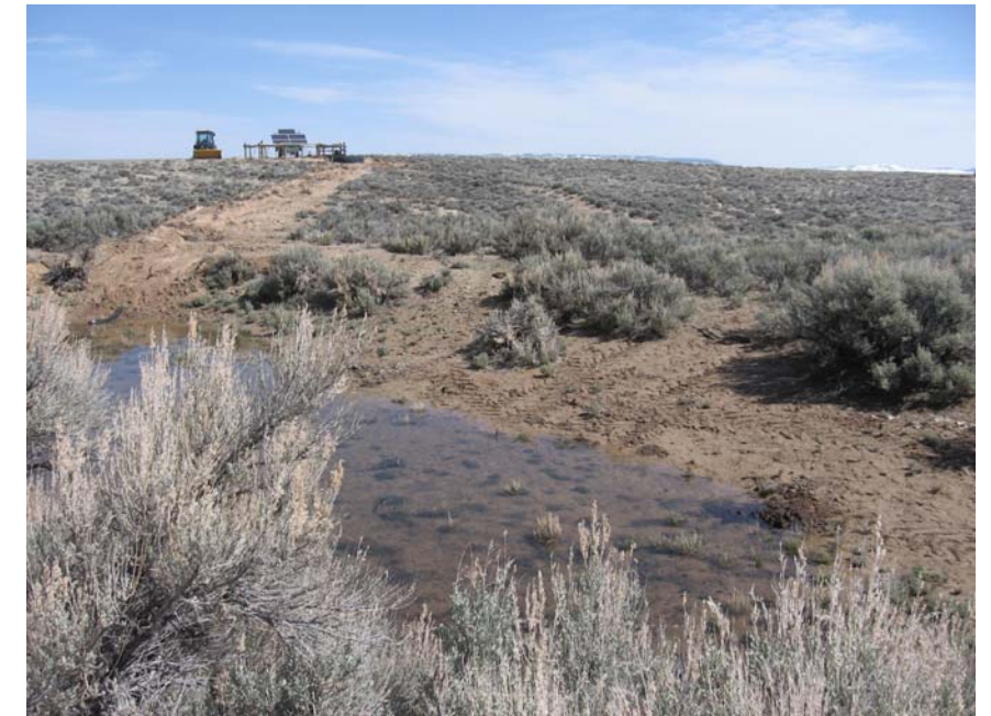
Battle Pipeline from Battle Spring Draw Well No. 4551 to dirt 'tank'. April 2009.