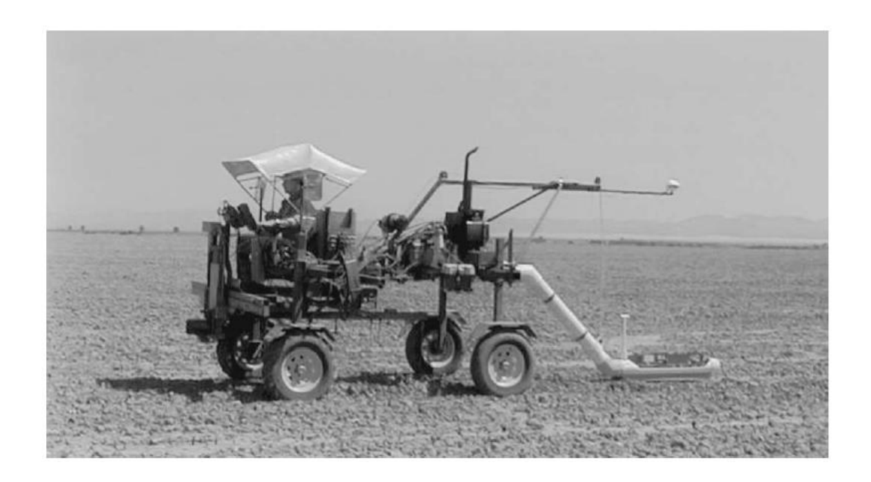
Figure 3. Mobile dual-dipole electromagnetic induction equipment for the continuous measurement of apparent soil electrical conductivity (Corwin and Lesch, 2003).

package, ESAP-95, to select optimal sites for calibration of the relationship between the apparent soil electrical conductivity measured with EMI and the EC of the soil water at different depths measured in the laboratory (Lesch et al., 2000). The soil samples can be easily taken with a soil coring device in the back of a 1-ton pickup with a 2-inch diameter device that can go down 4 to 6 feet or deeper if soil conditions permit. The theoretical background of ESAP-95 is presented by Lesch and his colleagues (Lesch et al., 1995a; Lesch et al., 1995b). Several applications of this software have been reported in the scientific literature (Amezketa, 2007; Amezketa and Lersundi, 2008; Corwin and Lesch, 2003; Corwin et al., 2006) as well as by consulting companies<sup>7</sup>.